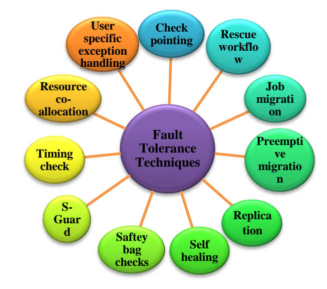
figure 2: fault tolerance techniques

It is required to implement in the system due to following reasons: a) The nodes which are defined by user in cloud are cheaper, less authoritative and less reliable, b) The communication faults like connection time out impact the reliability of cloud. The main aim of using fault tolerance techniques is to achieve reliability, robustness and availability in every system of cloud computing environment [7]. The following Fig.2 indicates different fault tolerance techniques use in cloud computing environment.